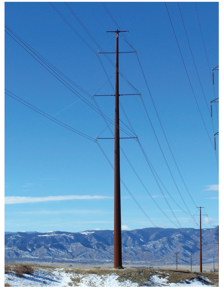
This is a representative 345kV transmission line structure south of Denver. Public meetings for the proposed transmission line will be held in Parker on September 29, 30 and in Aurora on October 1.